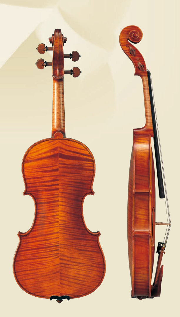
V20SG Yamaha Violin

The V20G is Guarneri-inspired violin which produces a rich and sweet, yet powerful sound. Each instrument is painstakingly finished with a specially formulated shading oil varnish which gives a beautiful appearance and warmer tone. The wood material has been carefully selected. The V20G offers excellent sound and playability, with consistent quality in every instrument.