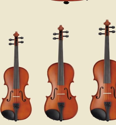
V3SKA available in 1/2, 3/4 and full sizes. All come complete with bow, case and rosin

This introductory model provides beginners with an instrument that plays with a satisfying tone, while offering outstanding durability. Each instrument is handcrafted utilizing the same traditional methods as used on high-end violins. V3SKA comes complete with case, bow and rosin so you have everything you need to play right away.